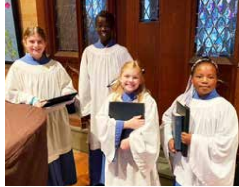
St. Paul's Choristers sang with the choir on Sunday, October 24th.