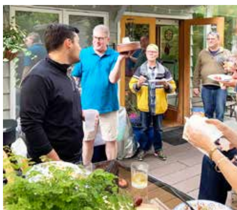
In June, the choir holds a joyous celebration following their dedicated choral season.