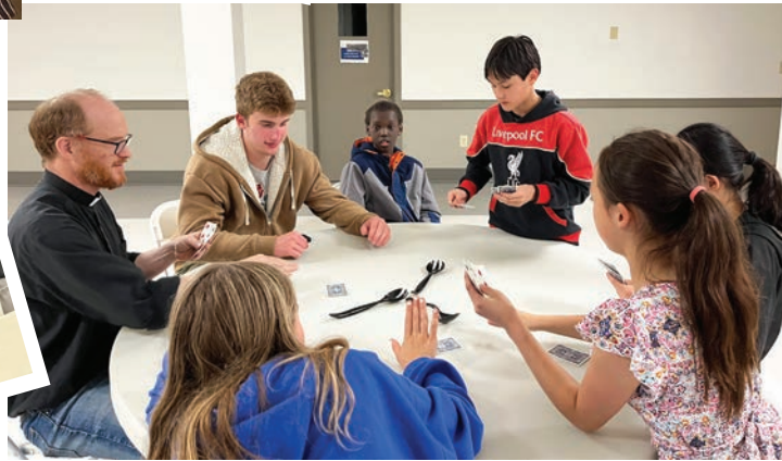
The Youth Group playing a competitive game of "Spoons"