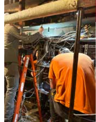
New energy-efficient LED lights and a digital dimming system are being installed in the church. Also pictured, rewiring the new dimmer system in the basement. The dimming project will be completed on March 11 when the system is programmed.