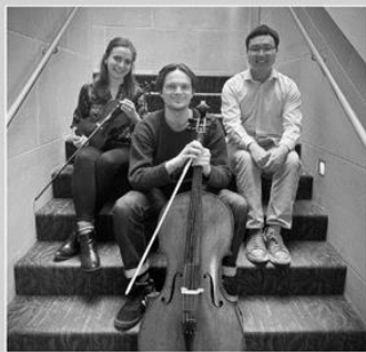
High Falls Trio

Sunday, April 28 at 4PM St. Paul's Episcopal Church 25 Westminster at East